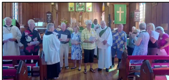
New Members with their Sponsors after the October 2nd Welcoming Ceremony.