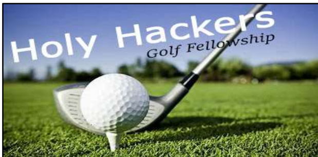
Recap Holy Hacker Outing Saturday, June 11th

Prior to going to bed last night, I watched the weather on two different stations just to give me a bit of a heads up as to what the Holy Hackers may be expecting Saturday morning. Well let me tell you - what I saw and heard did not give me a warm and fuzzy feeling about having a dry and sunny day for the Holy Hackers. I knew at that time I would not be getting a very good night's sleep just knowing what may be lying ahead weather wise. To prepare myself even more for the forthcoming weather phenomena I laid out my very own early warning weather