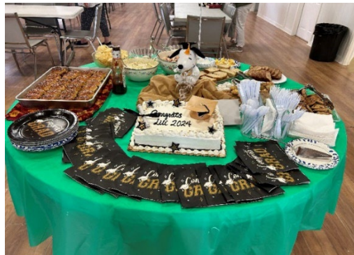
Figure 4-Celebration for Lili