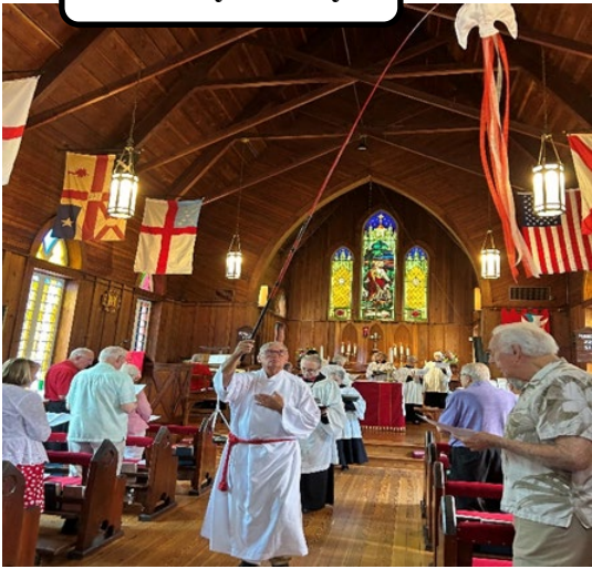
Figure 1-Randy Sivars carrying the dove on Pentecost Sunday