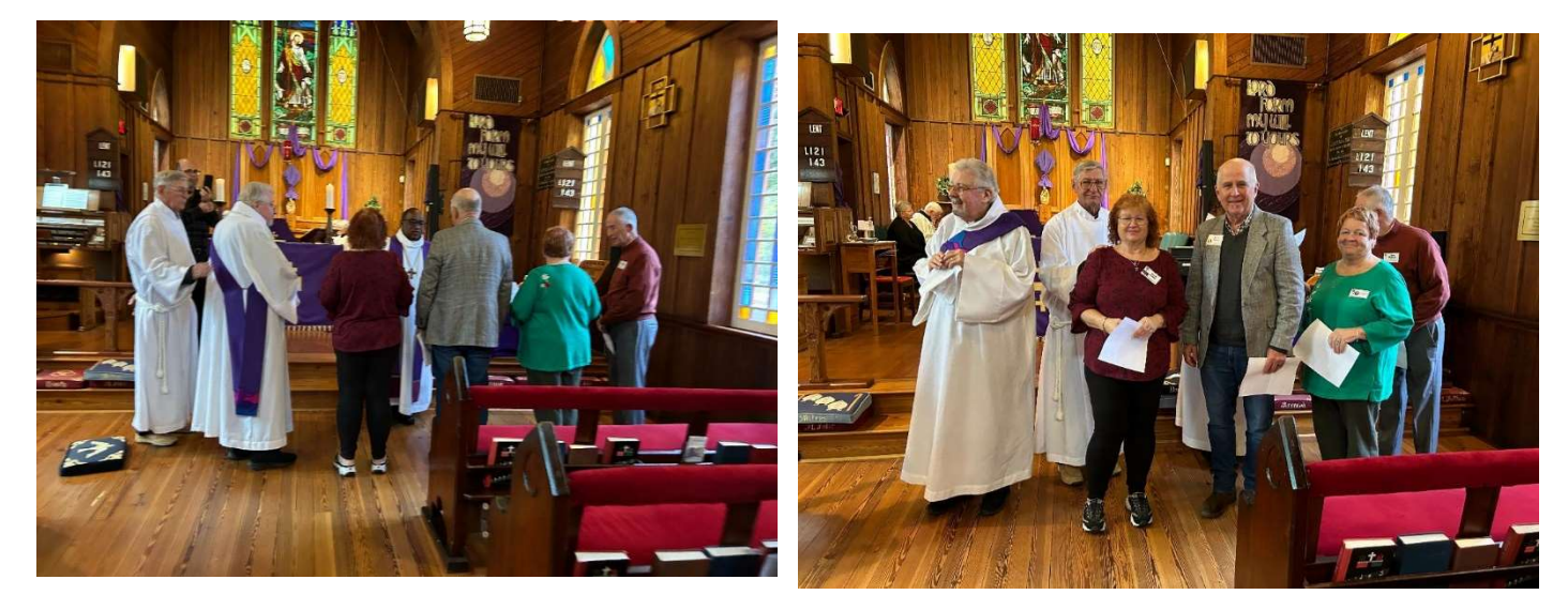
Commissioning of Vestry Members